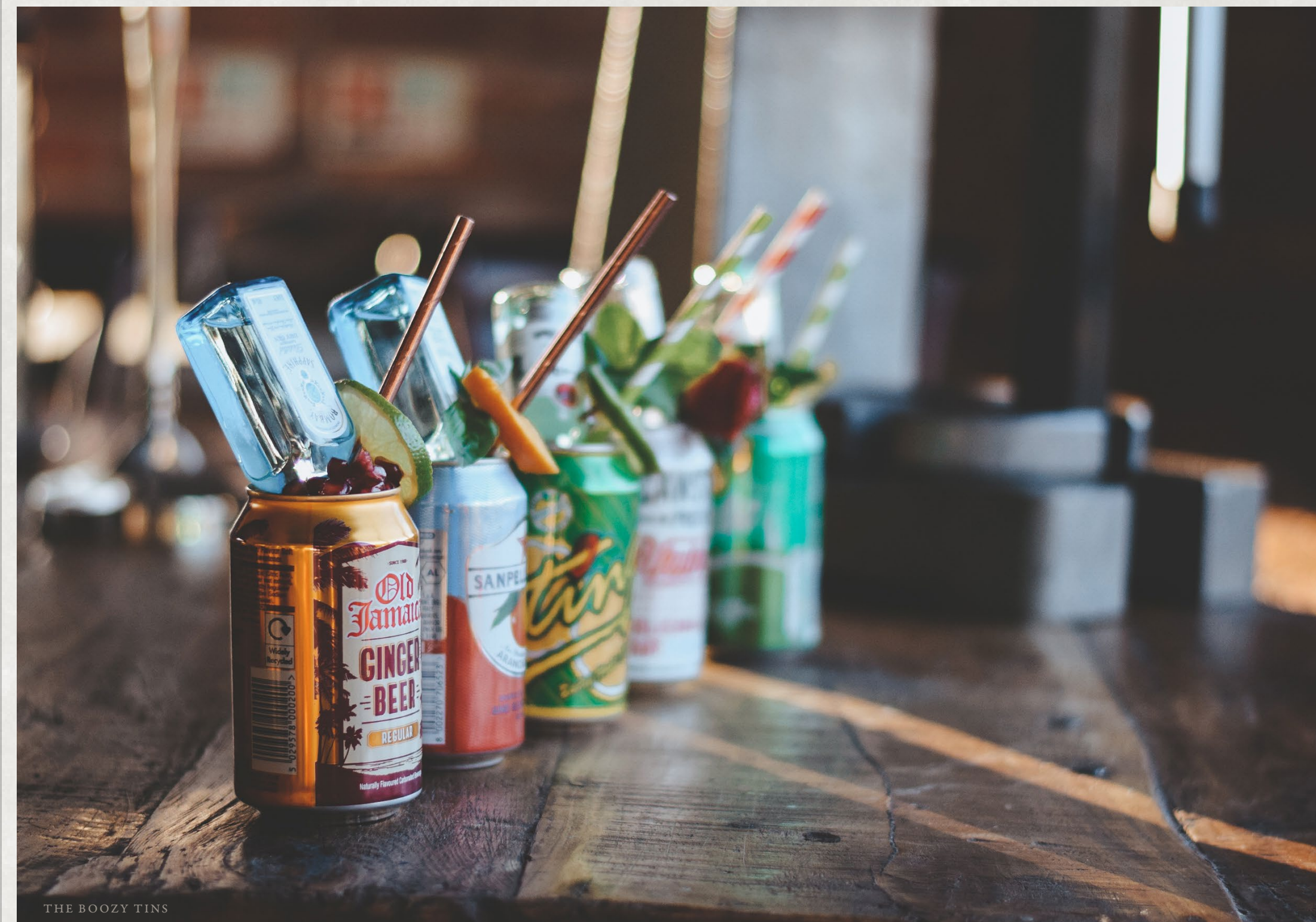
THE BOOZY TINS

A complimentary arrival drink will be added for bookings Monday - Thursday for 50+ guests